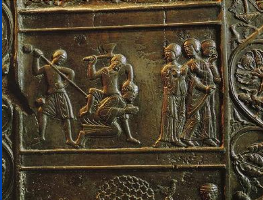
Martyrdom of Adalbert, Gniezno Doors of the Cathedral of St. Mary