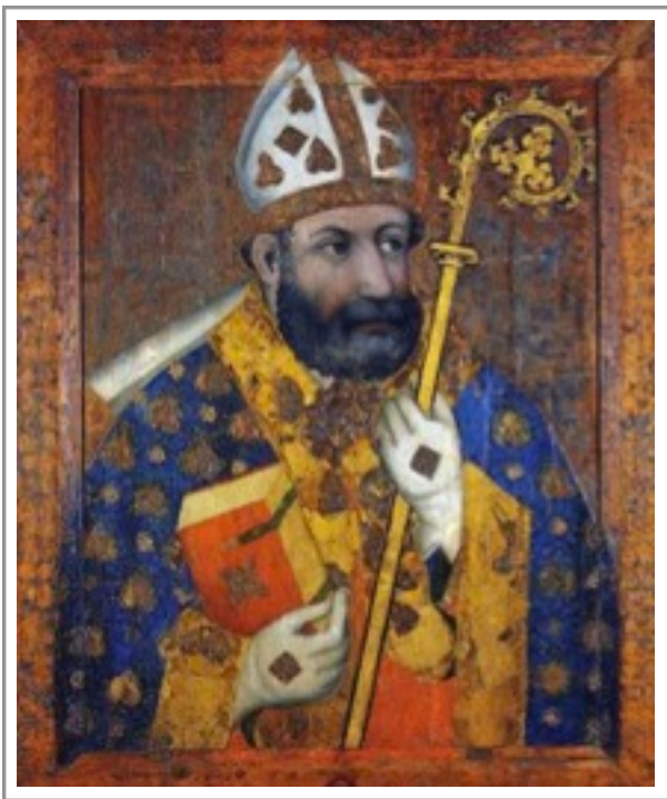
Picture: Representation of Adalbert in Karlstejn near Prague

But in a political sense as well Adalbert rather stands for European than national aspects. He could even be called a 'political' saint, in as much as throughout his life he got entangled in political machinations. In the history of his veneration he also suffered something like an 'instrumentalization' from diverse political sides. This may be noticed in the depiction in the form of a panel which Charles IV ordered to be painted in the workshop of Master Theodoric in the Holy Cross Chapel for the impressive Karlstein Castle in the heart of Bohemia: 15