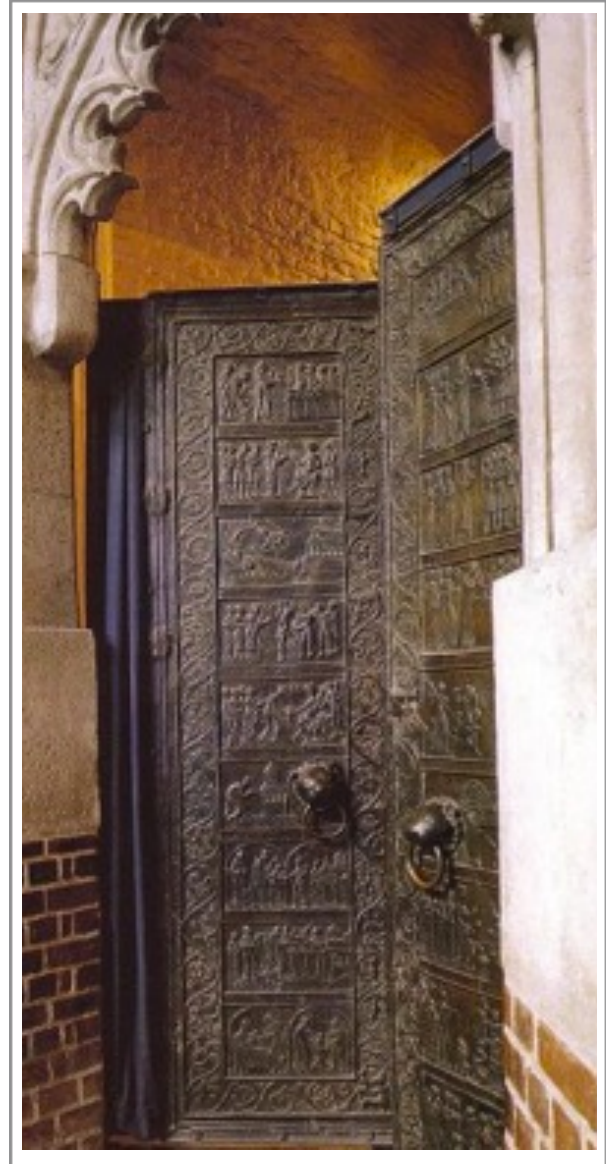
Picture: The Gniezno Doors of the Cathedral of St. Mary with scenes of the life of Adalbert of Prague (, p. 81)

John Paul II had invited the Presidents of Poland, the Czech Republic, Lithuania, Germany, the Slovak Republic, the Ukraine, and of Hungary to share in celebrating the millennium of St Adalbert’s martyrdom. In this way he adequately expressed the European dimension of remembering Adalbert. Whoever involves himself in the hagiography of the Saint and the stations of his life and work and whoever sees the unusual veneration of this Saint continued to this day, he or she cannot avoid noticing the important European dimension of the figure of St Adalbert. The stations of his life alone establish a map of Europe. His charisma links up and integrates the countries of Central Europe and lays the foundations to European togetherness and unity. He is one of the founder figures of this continent, displaying a definitely European identity. Above all in Gniezno, but also in Prague, Aachen and Rome with regard to Adalbert as a European saint a relationship should be cultivated which encompasses the entirety of his biography and of the effect he has on the world around him.