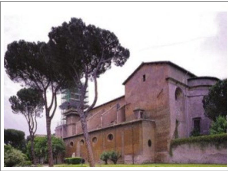
Picture: Monastery of St. Boniface and Alexius in Rome today (, p. 36)

On a high level of his saintly life he now shares in the everyday monastic routines, protesting violently when his fellow monks attempt to appoint the former bishop to some or other official function, such as the consecration of churches. On Aventine Hill he consciously devotes himself to the lowly life of a monk. He carries out humble duties and spends a lot of time in prayer, meditation and contemplation.