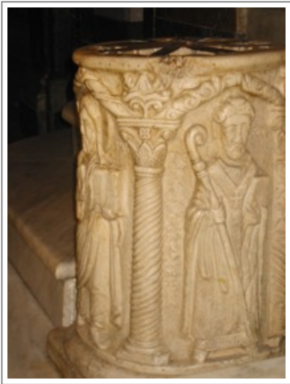
Picture: Oldest representation of Adalbert: baptistry of S. Bartolomeo

Such place of remembrance is above all Santo Bartolomeo Church on the Tiber Isle. The most ancient depiction of Adalbert is found in Santo Bartolomeo. It is a stone relief decorating the edging of the baptismal font.