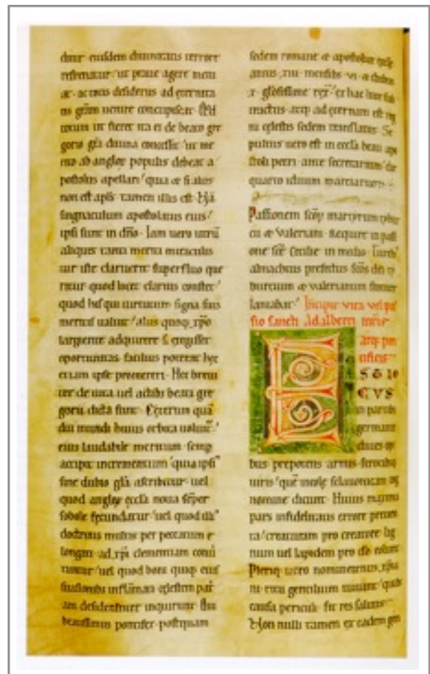
Picture: The rediscovered Aachen-script of the Adalbert-vita: Initial E in a manuscript of the Vita of St. Adalbert, 1200

Showing understanding of historical coherence and continuity the Adalbert-Foundation deals with political contexts in the spirit of the remembrance, the memoria of St Adalbert. In the course of historical research being stimulated and carried out during the Adalbert millenni-