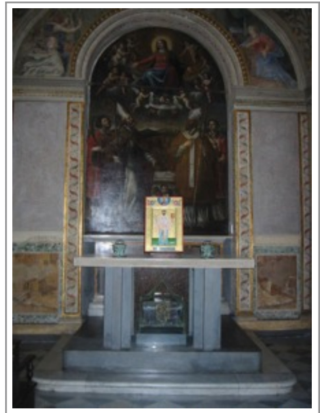
Picture: Relics of Adalbert under the altar of S. Bartolomeo

It contains the relics which Otto III received from Boleslaw the Brave on the occasion of his visit to Gniezno in the year 1000. In other respects as well Rome is a centre of veneration of Adalbert, as Rome surely displays many important aspects of the life of Adalbert. With regard to