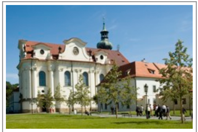
Picture: The monastery Brevnov in Prague today

Pope and Rome. Contrary to his own wishes, Adalbert obeys the Pope and in 992 returns to Prague. His episcopal work at first is looked upon kindly by the Prague faithful who have promised to mend their ways. With the help of the duke and assisted by 12 monks brought along from the Roman Alexius Monastery Adalbert establishes the Benedictine Monastery of Brevnov.